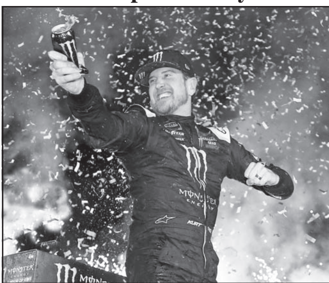
Kurt Busch celebrates Kentucky Victory

Top-10 leaders after 13 of 23: 1. Enfinger-542, 2. Friesen-508, 3. Moffitt-501, 4. Crafton-